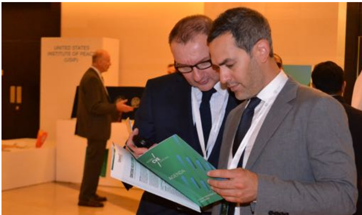
Guests decide on the panels and workshops they would like to attend.

It is in this context that there is an urgent need to encourage more effective collaboration on counter-narratives, drawing from experiences of policymakers, practitioners and industry/private sector representatives. In this regard, national security is safeguarded through international collaboration. In response, the Global CVE Expo 2014 was initiated. It had an immense impact on the CVE community by bringing various sectors together as