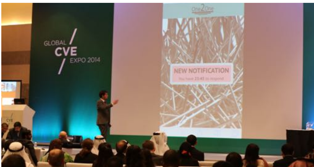
One2One, one of the four app prototypes presented during the Hackathon.