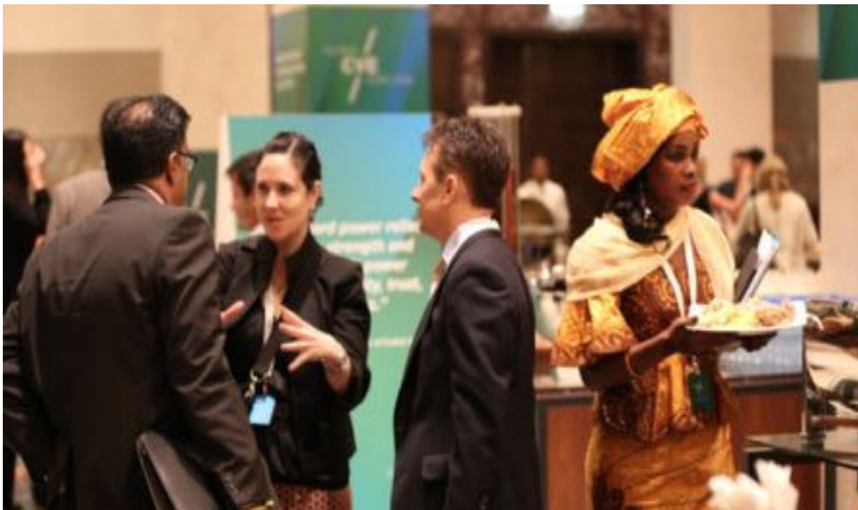
Guests from different parts of the world were able to use the Expo as a platform to discuss CVE challenges and solutions.

To close the Expo and also in celebration of Hedayah's second anniversary since its launch on 14 December 2012 by H.H. Sheikh Abdullah Bin Zayed Al Nahyan, UAE Minister of Foreign Affairs at the Global Counter Terrorism Forum Third Ministerial Meeting in Abu Dhabi, UAE, Hedayah hosted its second anniversary Gala Dinner. The main highlight was the announcement of a € 5 million pledge to Hedayah by Marcus Cornaro, The European Union Deputy Director General of the Directorate General for Development and Cooperation, EuropeAid, to implement programs that will help support civil society organizations around the world and in giving them the tools necessary to develop their own approaches.