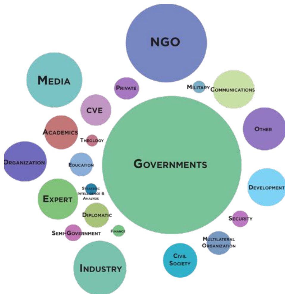
Figure 1.3 PARTICIPANTS BY SECTORS

On the final day of the Global CVE Expo, panels and workshops tied together the discussions